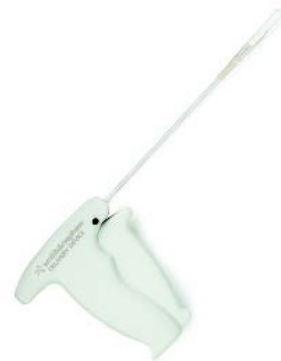
REGENETEN ◇ Bioinductive Implant