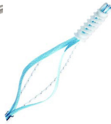
HEALICOIL ◇ REGENESORB Suture Anchor